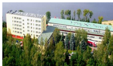
Rewita Centre WDW Rynia

High-quality hotel services and an excellent location promote physical activity and recreation. The above-mentioned hotels are conveniently situated at the eastern shore of Zegrze Lake - 30 kilometres from the centre of Warsaw, and surrounded by an expansive enclosed forest complex will provide our Guests with silence and relaxing comfort.