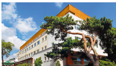
Training Centre „Allianz”

Accommodation and catering have been booked for Conference Guests at Training Centre "Allianz" and Rewita WDW Rynia. Short distance from Warsaw, closeness with the nature, and comfortable accommodation conditions will let you relax and recreate.