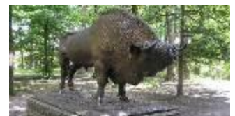
European bison reserve in Spała

Stowarzyszenie Chorych na MPS i Choroby Rzadkie ul. Radnych 9A, 05-503 Głusków