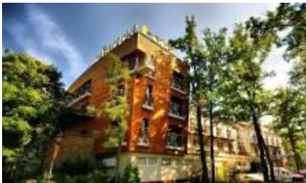
Hotel Mościcki Resort Conference ****

The board and lodging for Conference guests will be provided in the Mościcki**** Resort & Conference Hotel. The quality of services together with the natural beauty of the Spała Landscape Park will let you revive your spirits and restore your energy for further work.